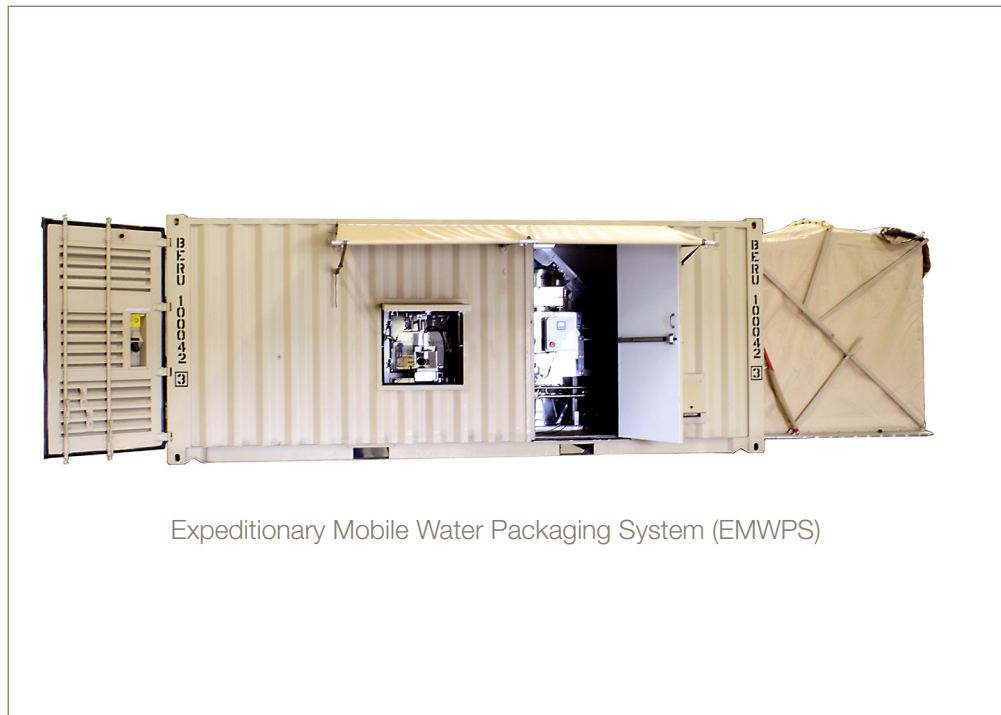
Expeditionary Mobile Water Packaging System (EMWPS)

phone 310 608 5600 fax 310 608 5692 vmt@parker.com www.villagemarine.com www.parker.com/watermakers