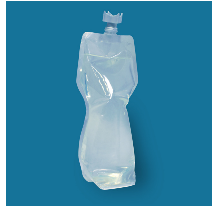
Water pouch as shown