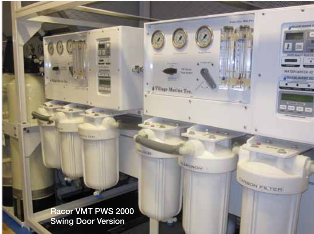
Racor VMT PWS 2000 Swing Door Version

The goal of many of these yacht owners is to be completely self-sufficient on board so they can travel to just about anywhere, at any time, and still have all the luxuries and privacy they desire. One of the biggest challenges in meeting that goal is securing a reliable source of fresh water while out at sea.