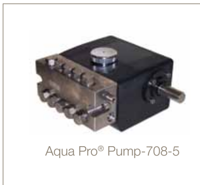
Aqua Pro® Pump-708-5