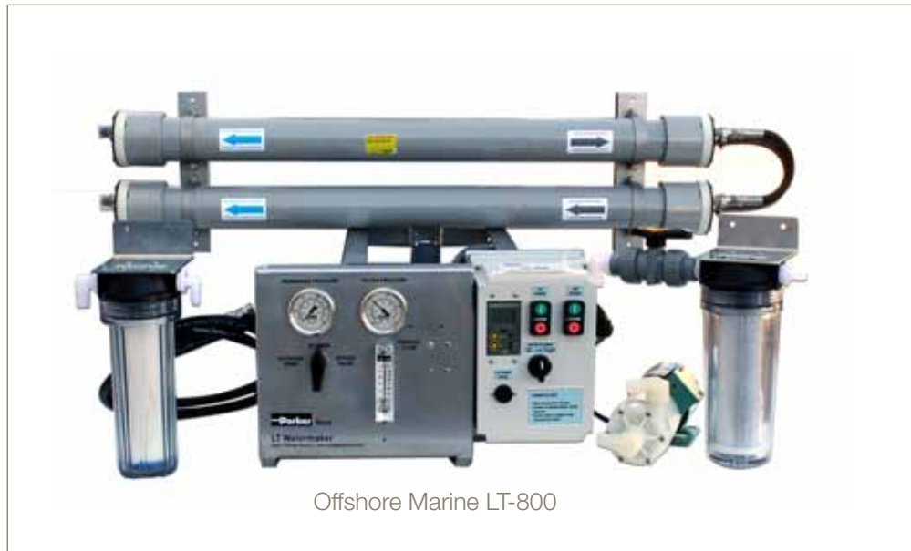
Offshore Marine LT-800

The units feature a semi modular frame format, for installation flexibility. The frame is compact and can be above or below the water line. The boost pump and prefilters are supplied as loose items.