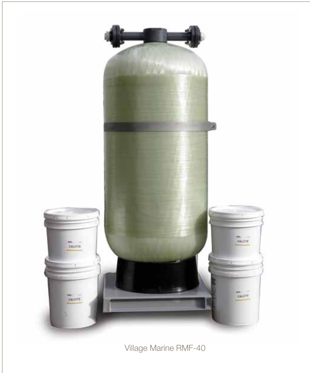
Village Marine RMF-40