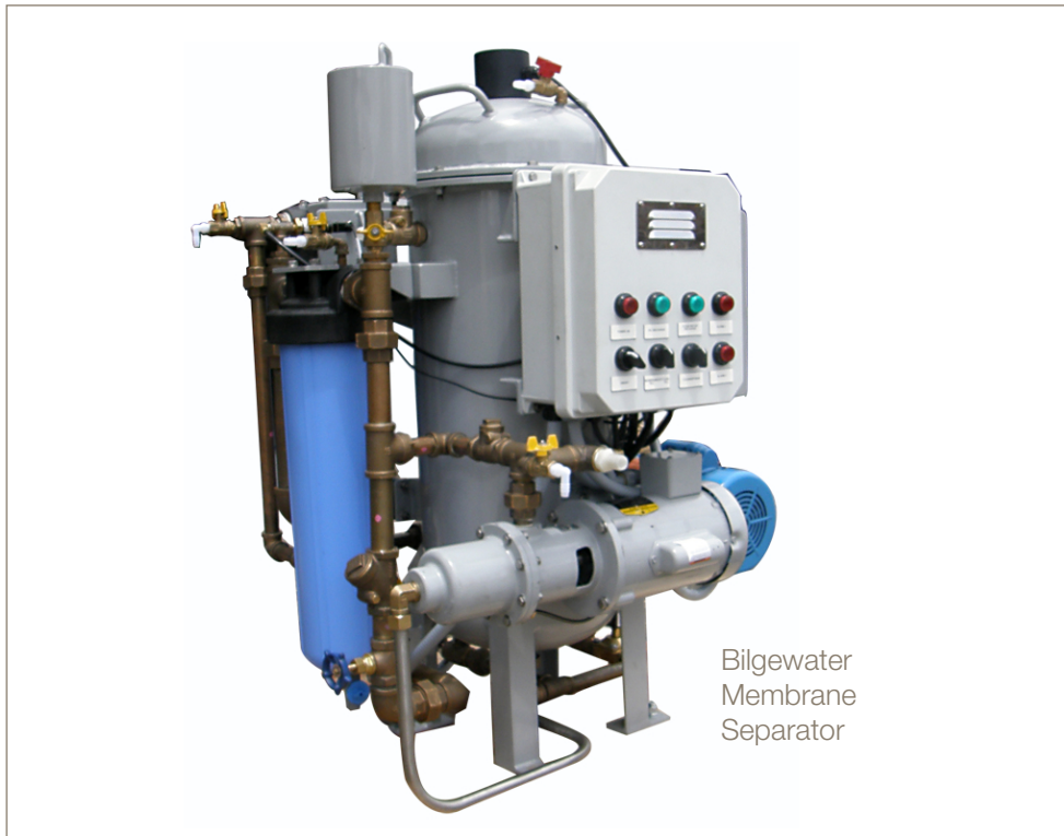
Bilgewater Membrane Separator

Heavy duty construction, corrosion resistant materials, permanent oil attractant media, quiet operation, automatic diversion valves and advanced Parker Water Purification membrane technology result in an easy to use, fully automated, high quality, affordable solution to meet your bilge water treatment needs.